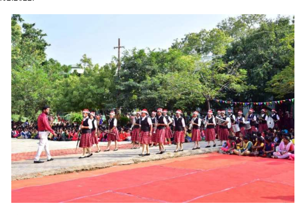
On 14<sup>th</sup> March 2023, the Band students received the chief guests and played during the March past.

Students performed on 5<sup>th</sup> September 2022 honouring the teaching faculties of our College for Teachers Day. They also performed for the Christmas Celebration for receiving the guests on 22.12.2022.